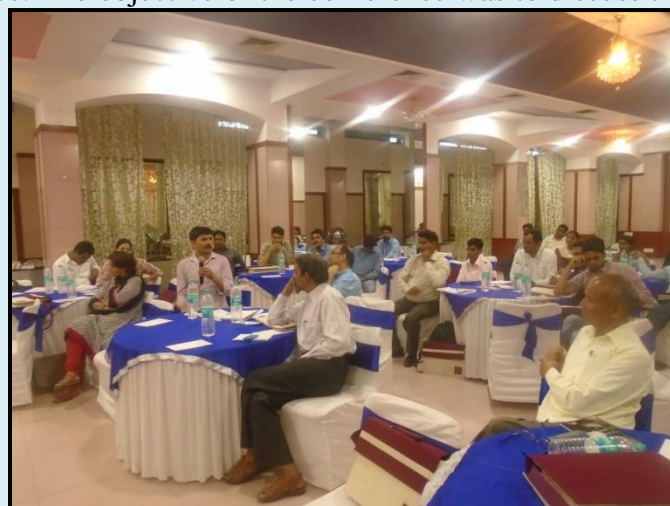
Participants during the Workshop on Inequality

A two days workshop on inequality was held on 27-28th March at Jaipur, Rajasthan. This workshop was organized by BARC (Budget Analysis Rajasthan Centre) in collaboration with CBGA (Centre for Budgeting and Governance Accountability), Oxfam