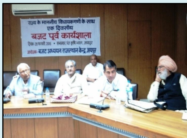
Pre- Budget workshop with MLAs

Pre- Budget MLA workshop: Every year BARC conducts a workshop for the MLAs of the state before the state budget is presented in the Vidhan Sabha. This year the MLA workshop was conducted on February 28 th , 2015 at Pant Krishi Bhavan, Jaipur. More than 50 participants attended the workshop including 15 MLAs and representatives of various NGOs. Various issues related to state budget, finances and development related issues were discussed in the workshop.