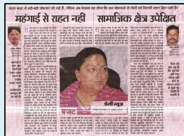
Article on Analysis of the Modified Budget, 2014-15 by BARC team members

April-June 2014 issue and the analysis for Modified Budget 2014-15 in the July- September Issues of Budget Samachar , BARC's quarterly news letter. Similarly, the budget for the present financial year 2015-16 which was presented by the State Government in March 2015 was also analyzed and this analysis has been shared with various Media, NGOs and MLAs. A detailed analysis of the Budget was also published in the Budget Samachar in the April to June issue. The articles and write ups of the BARC team members on the analysis of the State Budget were also