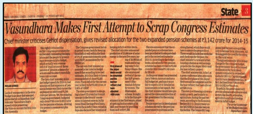
Article on Analysis of the Interim Budget, 2014-15 by BARC Convener

BARC studied, analyzed and shared the data and information with media, various CSOs and MLAs for both interim and modified budget. Along with the analysis of budget and policies towards the social and economic development of the state, BARC also analyzed the budget for SCs, STs (SC-SP and TSP budget), minorities groups, children, and women (gender budget). Many newspapers used the information provided by BARC while reporting about the State Budget. An analysis of the Interim State Budget 2014-15 was also published in the